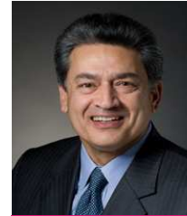
Rajat K. Gupta