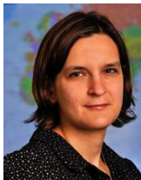
Dr. Esther Duflo

Pratham USA congratulates Dr. Esther Duflo on being awarded the John Bates Clark Medal, also known as the "Baby Nobel Prize in Economics" given to the most promising economist in the United States under the age of 40. This is widely regarded as one of the field's most prestigious awards, perhaps second only to the Nobel in economic science. Approximately 40% of the winners have subsequently been awarded the Nobel Award. Dr. Duflo is a Professor of Economics and the Director of the Abdul Latif Jameel Poverty Action Lab (J-PAL) at the Massachusetts Institute of Technology. Pratham's work has been studied extensively and endorsed as a Millennium Development Goals "best buy" by J-PAL under the leadership of Duflo and Dr. Abhijit Banerjee, Ford Foundation International Professor of Economics. Duflo and J-PAL have been part of multiple randomized studies with Pratham which helped evaluate a range of Pratham programs. The researchers continue to study Pratham's impact and plan to release new research on Pratham's flagship Read India program in 2011. We wish Dr. Duflo continued success in her work.